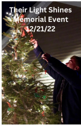
Their Light Shines Memorial Event 12/21/22