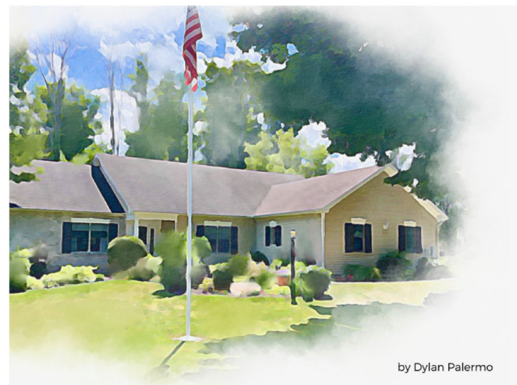
by Dylan Palermo

VOLUNTEERCOORD@WEBSTERCOMFORTCARE.ORG (585) 872-5290